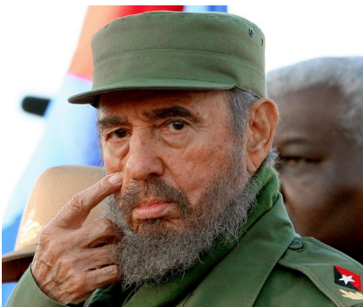
Fidel Castro as President.